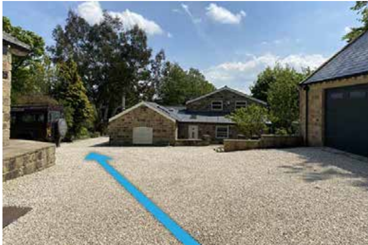
View of Barn Elm Lodge from the entrance gateway