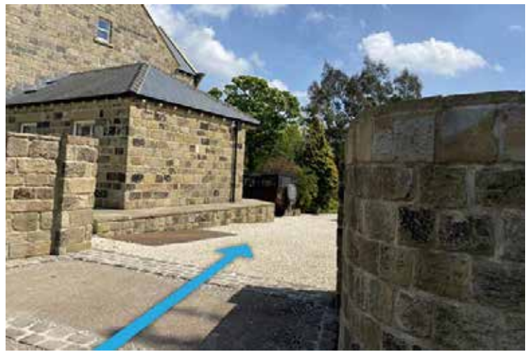
Entrance when approaching from Church Hill