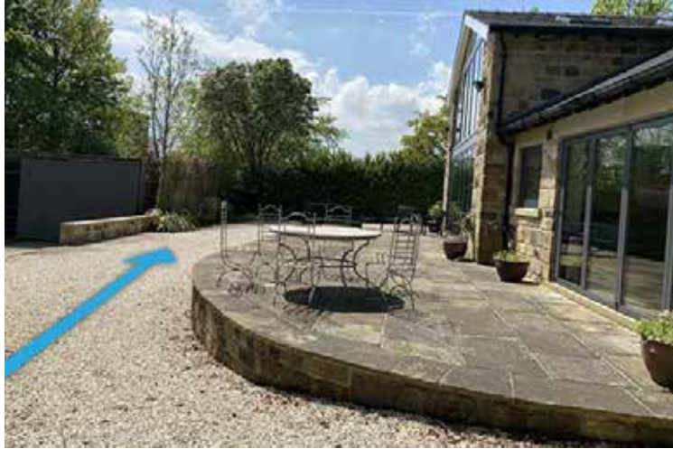
Carry on round the drive keeping the lodge on your right hand side