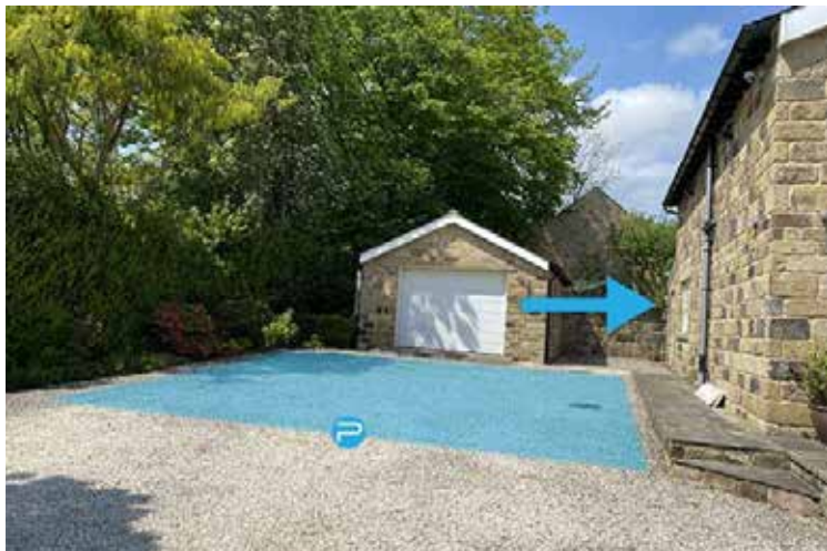
Park here and walk between the garage and the lodge to arrive at the front door