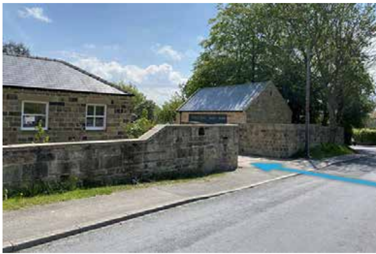
Entrance when approaching from Hall Green Lane